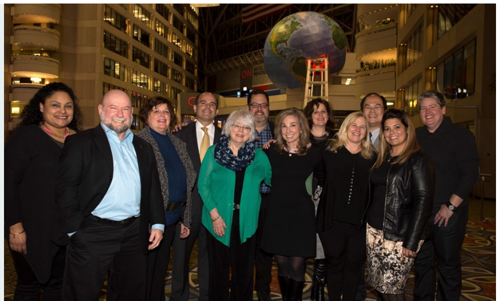
Photo of staff and some GEI trainers at CNN Center in Atlanta